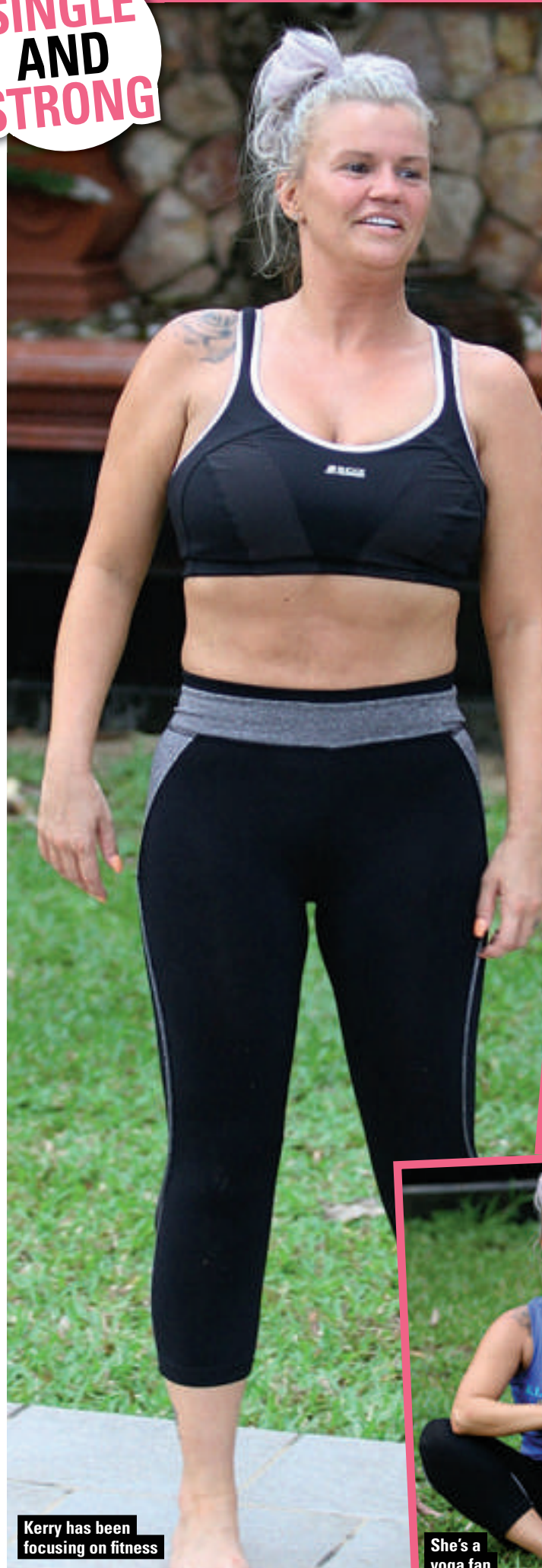
Kerry has been focusing on fitness