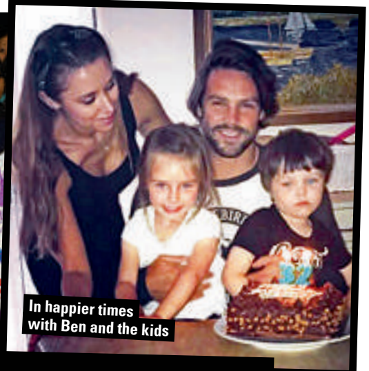
In happier times with Ben and the kids