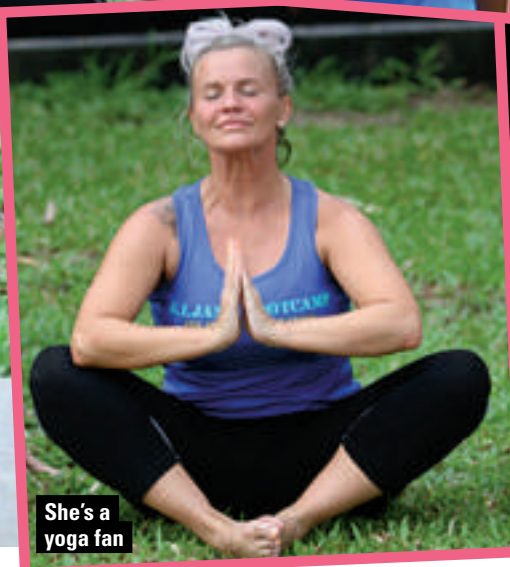
She's a yoga fan