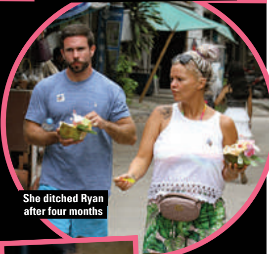
She ditched Ryan after four months

The Atomic Kitten is staying positive after ending things with boyfriend Ryan